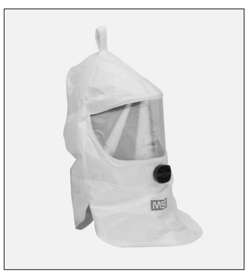
P/N 10041551 Saranex Hood Assembly - Shoulder Length