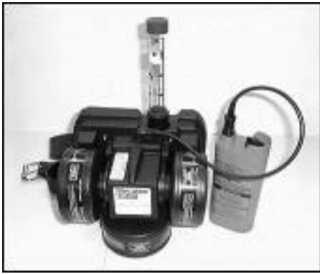
Fig. 3 Turbo unit with cartridges and flow meter