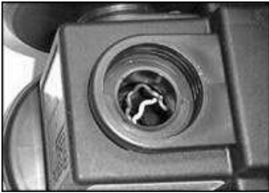
Fig. 2 Turbo inlet