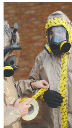
Knowing when and where to use protection is just as critical as the product itself. Kappler's expertise and innovation come together perfectly with ChemTape®.