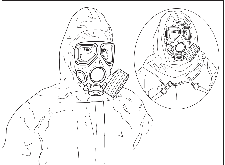
3M™ Full Facepiece FR-M40 with Cartridge FR-C2A1 and FR-64